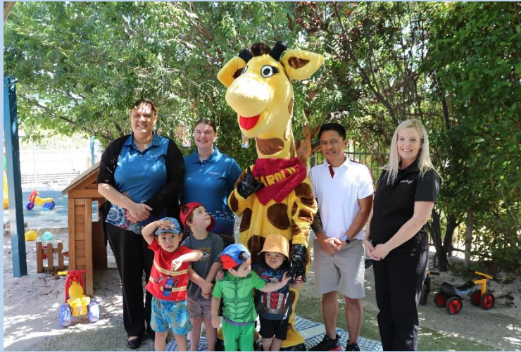
Bakers Delight Growing Good Garden winners 2024 (Mercy Care, Landsdale)