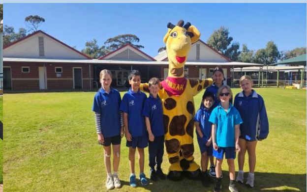
Students and Healthy Harold, Nth Kalgoorlie Primary school