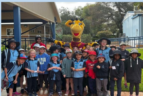
Students Kambalda Primary School

We look forward to engaging Life Ed again in 2025.